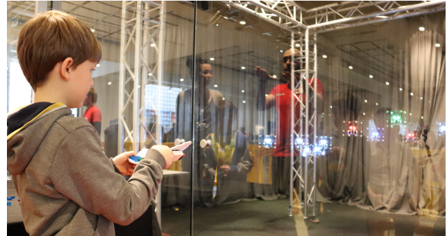
Figure 1. Child moving and bending the butterfly-shaped controller to control a drone swarm.

Permission to make digital or hard copies of all or part of this work for personal or classroom use is granted without fee provided that copies are not made or distributed for profit or commercial advantage and that copies bear this notice and the full citation on the first page. Copyrights for components of this work owned by others than the author(s) must be honored. Abstracting with credit is permitted. To copy otherwise, or republish, to post on servers or to redistribute to lists, requires prior specific permission and/or a fee. Request permissions from Permissions@acm.org . TEI '20, February 9–12, 2020, Sydney, NSW, Australia © 2020 Copyright is held by the owner/author(s). Publication rights licensed to ACM. ACM 978-1-4503-6107-1/20/02...$15.00 https://doi.org/10.1145/3374920.3374948