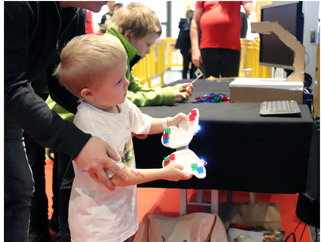
Figure 4. Child helped by his father, who guided movements and control of the drone swarm

Explorers - In contrast, many children were extremely active in manipulating the controller exploring the degrees of freedom and the limits of the control. A few children tried to turn the swarm over by flipping the controller over, yet when they reached the angular limit, they understood the constraint and would explore other