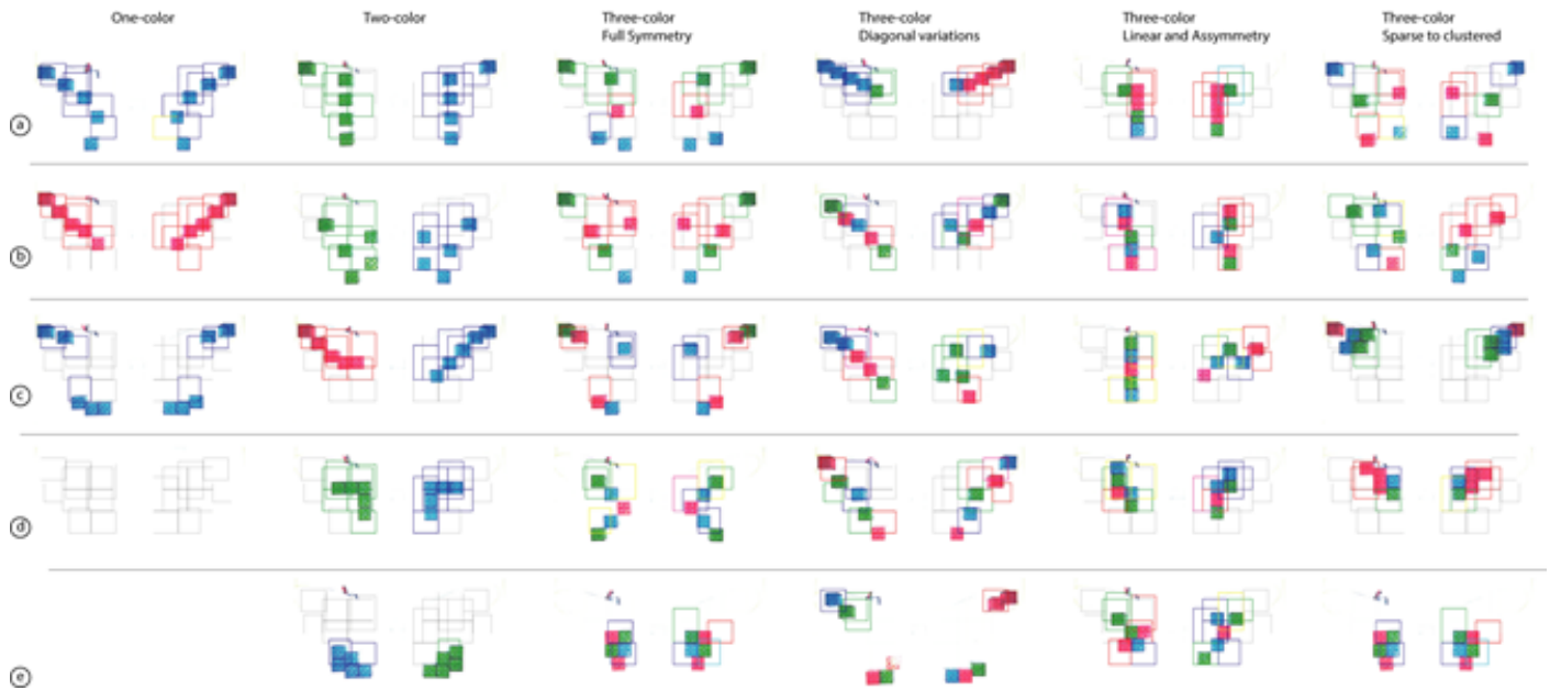
Figure 3. Variations in wing pattern decoration including one, two, and three-color designs.