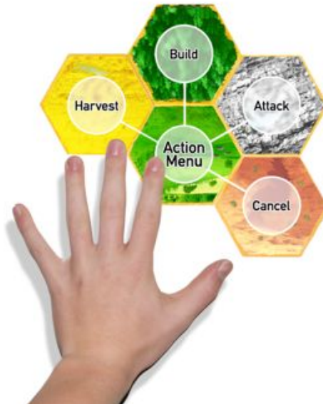
Figure 1: Hexagonal OLED displays simulated through tracking and projecting on cardboard tiles. Here, a marking menu is displayed on surrounding tiles upon obscuring an IR marker.

TEI 2010, January 25–27, 2010, Cambridge, Massachusetts, USA. Copyright 2010 ACM 978-1-60558-841-4/10/01...$10.00.