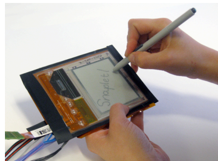
Figure 2. Snaplet held flat changes to a PDA with pen-based note taking functionality.

We propose that an emerging class of mobile computing devices, flexible computers, will address many of the above problems with current hardware. These flexible devices will be lightweight and will not have the rigid bodies and glass screens that can break when dropped. They can conform to shape of the user's