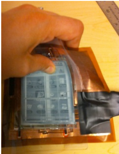
Figure 4. Example of bending a side (top) or a corner (bottom)