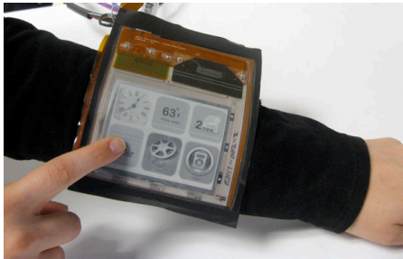
Figure 1. Snaplet, when worn in a convex shape as a wristband, switches its application context to watch and media player functionality.

purpose computers with increasingly sophisticated sensors and communication systems connecting them to the world.